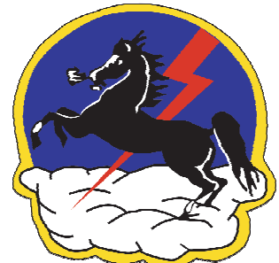
462nd Fighter Squadron 506th Fighter Group Iwo Jima '45