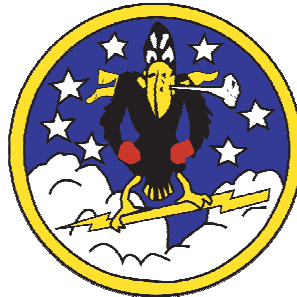
458th Fighter Squadron 506th Fighter Group Iwo Jima '45